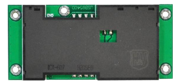
Top: SIM slot