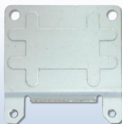
Metal Baffle x1 (Half to Full minicard bracket)