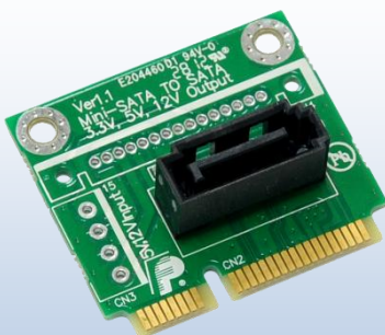
PMMD-C (SATA to half mSATA adapter) x1