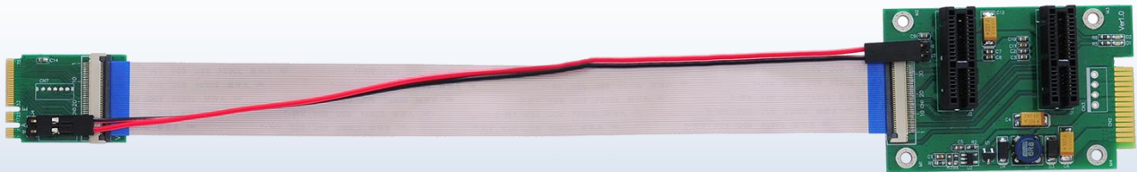
P11S-P11F M.2 (NGFF) to PCI-E Extender Board