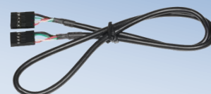
Dupont 4PIN to Dupont 4PIN USB cable x1

As a New manufacturer of quality computer connectivity products since 2009/Mar, BPLUS technology brings to market a broad range of upgrade products. These products bridge the connection between Desktop/Notebook systems and external peripherals.