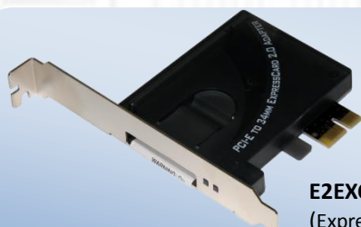
E2EXC-1AG (ExpressCard 34 to PCIe / USB Adapter) x1